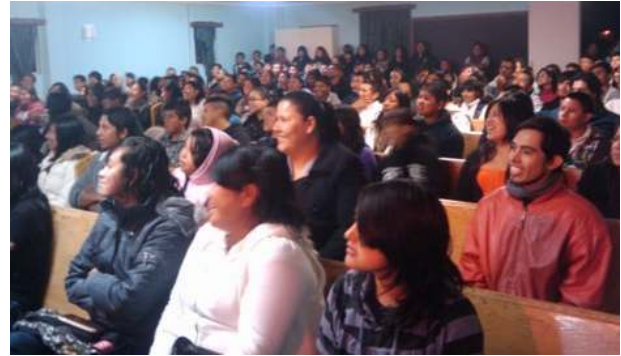
Above: The church is filled with youth at our conference in January.

children's teeth, as well as an anesthesiologist for those children that needed to be under for their dental work to be completed. Thirty-two children received dental care that day. We kept busy bringing the children over for their appointments and keeping them company while they waited. This is such an important ministry because these children would most likely not receive any dental care if these volunteers did not come.