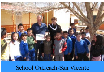
School Outreach-San Vicente