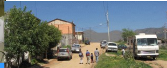
MDU serving in Ensenada