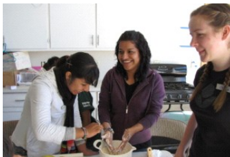
Angels making apple pies

After a long day with many challenges the team arrived about mid-night and quickly unloaded the bus. At one o'clock in the morning they fell into bed. Sunday morning the team joined the church for their Easter service and baptism. The service was alongside a stream and at the foot of a waterfall. Following the service each family prepared food and we cooked hamburgers. It was so interesting to go around and sample so many different dishes. Later in the afternoon people went home satisfied with full stomachs and having experienced an awesome day. Caronport does a great job presenting a children's program at the local church. This team is well prepared and it shows in the quality program. They also installed the insulation and hung the sheetrock in two classrooms at the church.