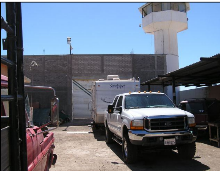
Our dental trailer was inside the outer wall of the Prison...