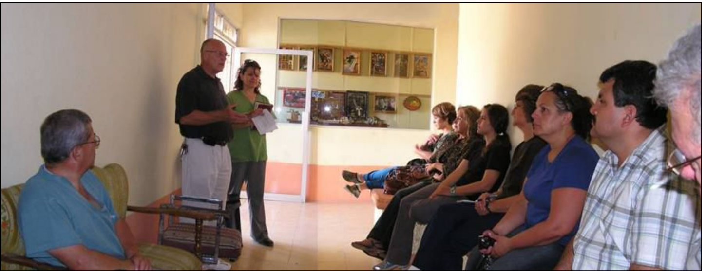
Even in the Prison Don began each day with a message from the Bible to the workers , and then we prayed as a group...